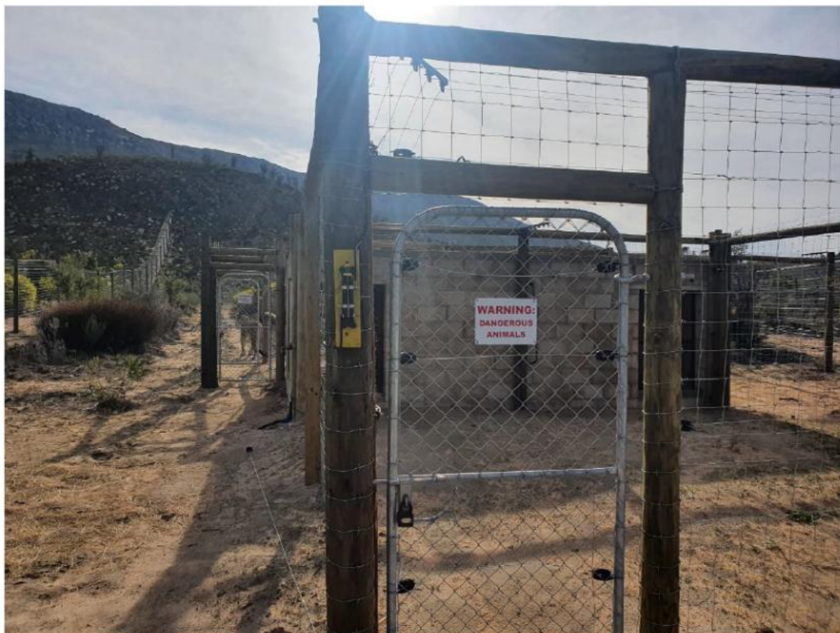
Example: Double gated access with warning signs and electric lines designed and constructed by J Olsen at Ubuntu Wildlife Sanctuary, Oudsthoorn