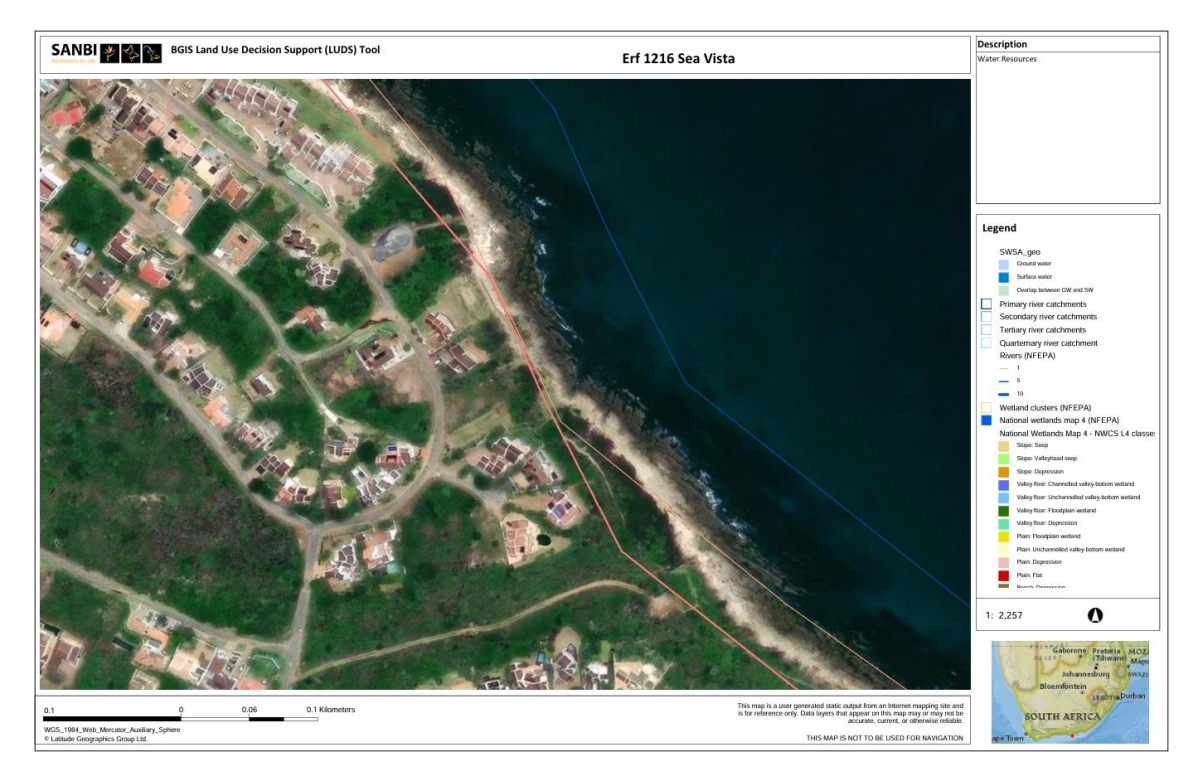
Figure 3: Water resources associated with Erf 1216 Sea Vista.

The screening reports indicate that the receiving environment has a LOW Aquatic Biodiversity Sensitivity. There are no identifiable features according to the screening report.