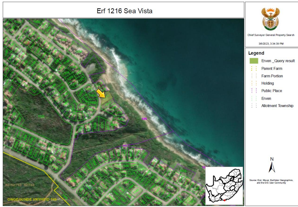
Figure 1: Location of Erf 1216 Sea Vista in the Kouga Municipality, Eastern Cape.

As required to compliment a Basic Assessment application the national web-based screening tool was used to generate an environmental screening report. The screening report lists a variety of specialist studies to be undertaken based on the data informants of the tool at the study area. This site sensitivity verification report, following ground-truthing of the site, motivates why certain specialist studies will not be required or conducted for the proposed development application.