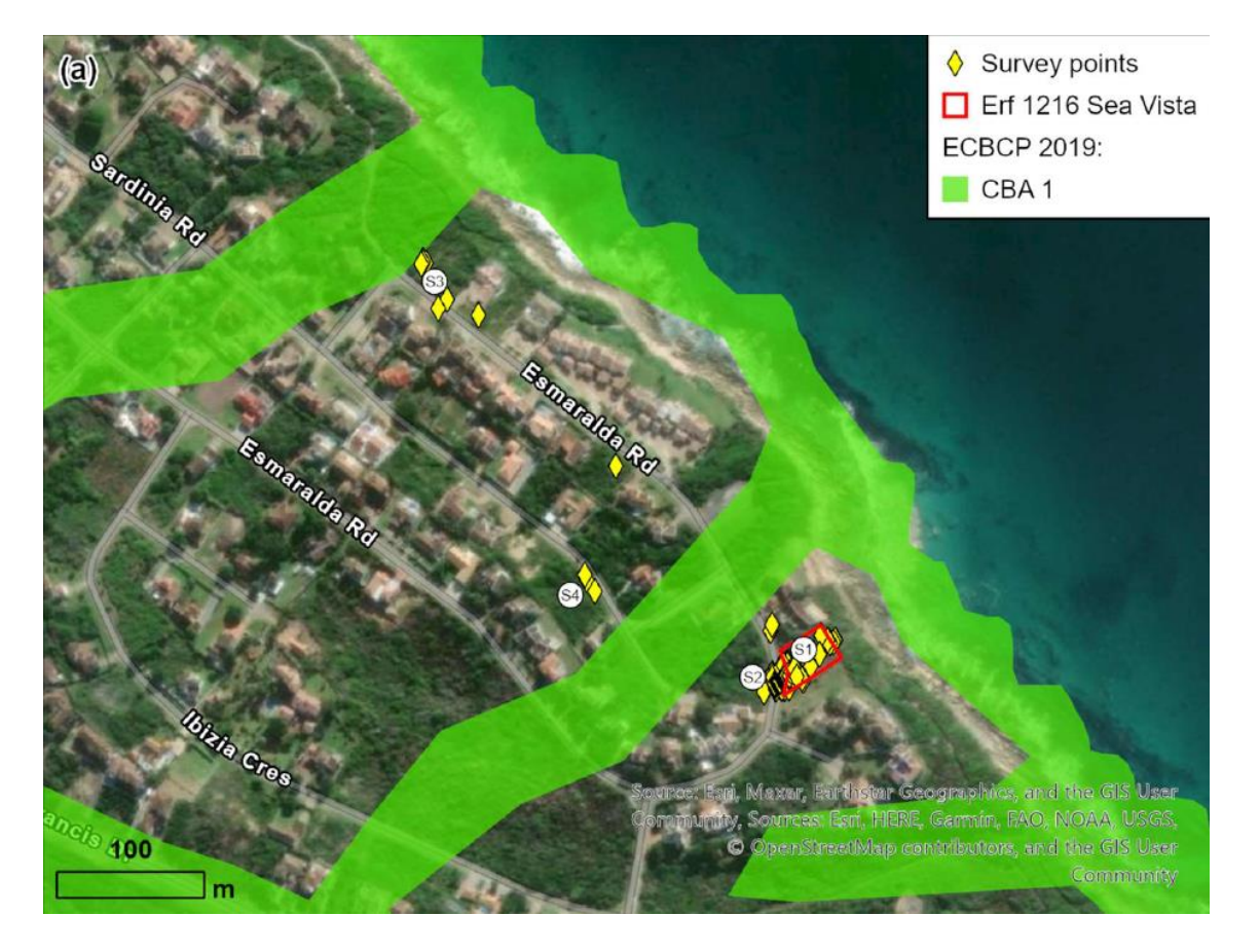
Figure 2: Critical Biodiversity Areas and Ecological Support Areas.

The Compliance Statement concluded that, due to the historical clearance of vegetation and associated disturbance to topsoils and the low likelihood of plant SCC occurring here, the site is of LOW sensitivity for terrestrial biodiversity and LOW sensitivity for plant species, and the clearing of vegetation likely had NO impact on threatened terrestrial biodiversity or plant SCC. Furthermore, this compliance statement is not subjected to any conditions.