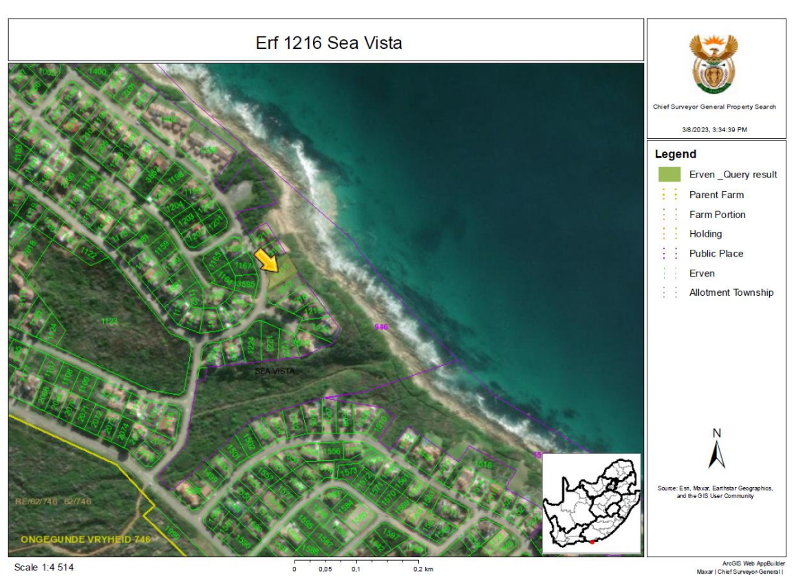
Figure 1: Location of Erf 1216 Sea Vista, St Francis Bay, Kouga Municipality, Eastern Cape

Erf 1216 covers an area of approximately 985 m<sup>2</sup> and is located in a coastal dune landscape. Most properties in the area have been developed for residential dwellings, but some properties adjacent to Erf 1216 remain undeveloped and still host indigenous vegetation.