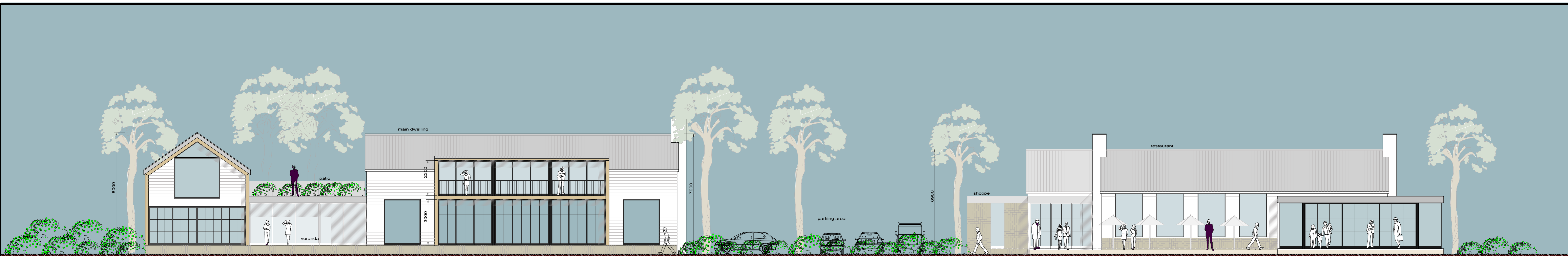
Proposed Northern/lagoon facing facade 1:100