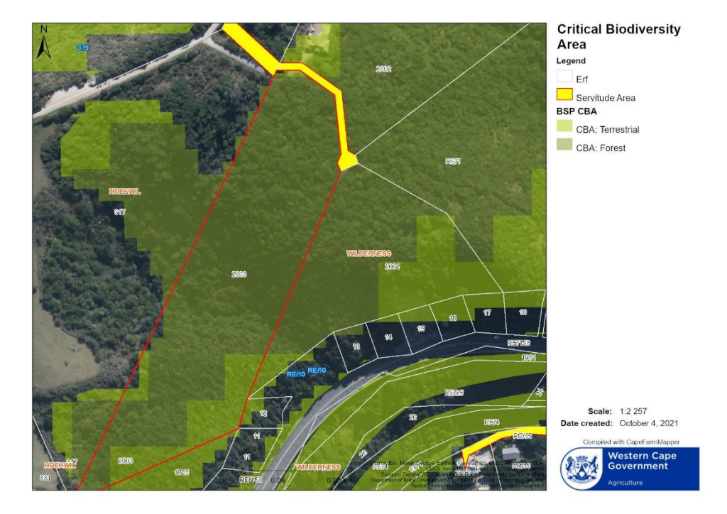
Figure 3: CBA areas