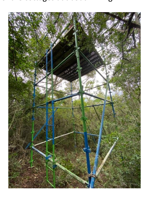
Figure 4: Scaffolding was placed on site

In this area and strip where the planned cottages are proposed the trees are much smaller because of the slope, the backdrop will have bush trees so the cottages will be enclosed by trees, but the front views will be open. Scaffolding was placed on the potential locations of the cottages at about 4m high.