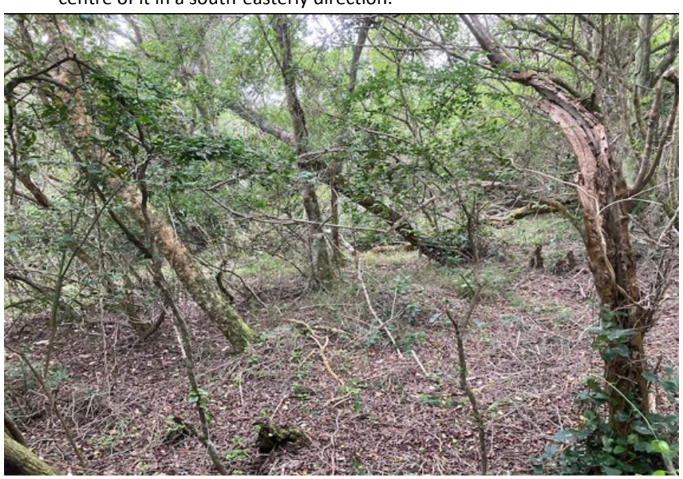
Figure 2: Typical view within the forest on site.

coastal thicket / forest. It is on a relatively steep sea-facing slope with a drainage valley passing through the centre of it in a south-easterly direction.