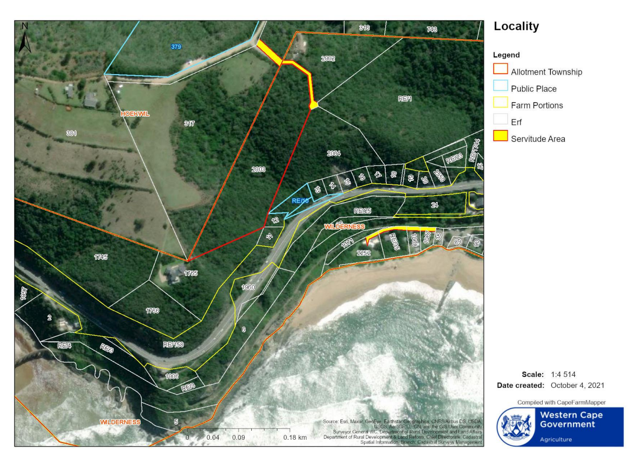
Figure 1: Locality of Erf 2003 (red polygon)

As required to compliment a Basic Assessment application the national web-based screening tool was used to generate a screening report. 1 The screening report lists a variety of specialist studies to be undertaken based on the data informants of the tool at the study area. This site sensitivity verification report, following ground-truthing of the site, motivates why certain specialist studies will not be required or conducted for the proposed development application.