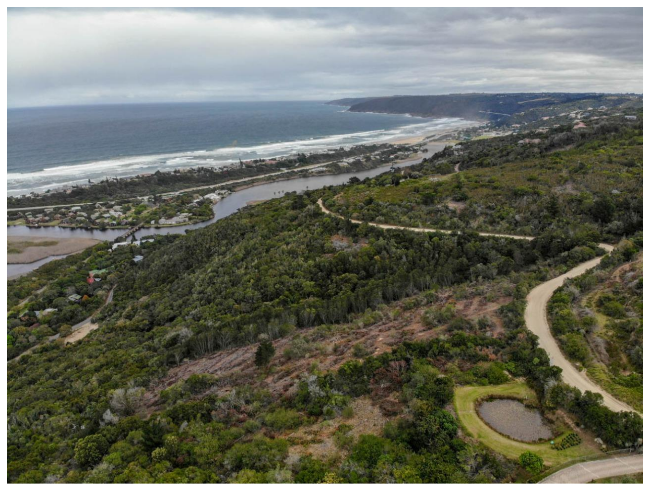
Figure 4. Photograph of the property.