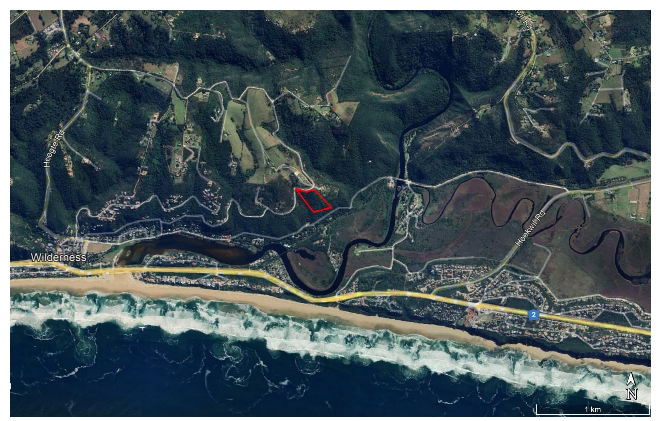
Figure 1. Locality map of the property (red outline), on the hills north-east of the town of Wilderness.

Environmental and change of land use authorisation is being sought for a proposed development on Erf 1058 in Wilderness, Western Cape Province (see location in Figure 1). In terms of the National Environmental Management Act (Act No 107 of 1998 - NEMA), an application for environmental authorisation requires an agricultural assessment. In this case, based on the verified low to medium agricultural sensitivity of the property (see Section 7), the level of agricultural assessment required is an Agricultural Compliance Statement.