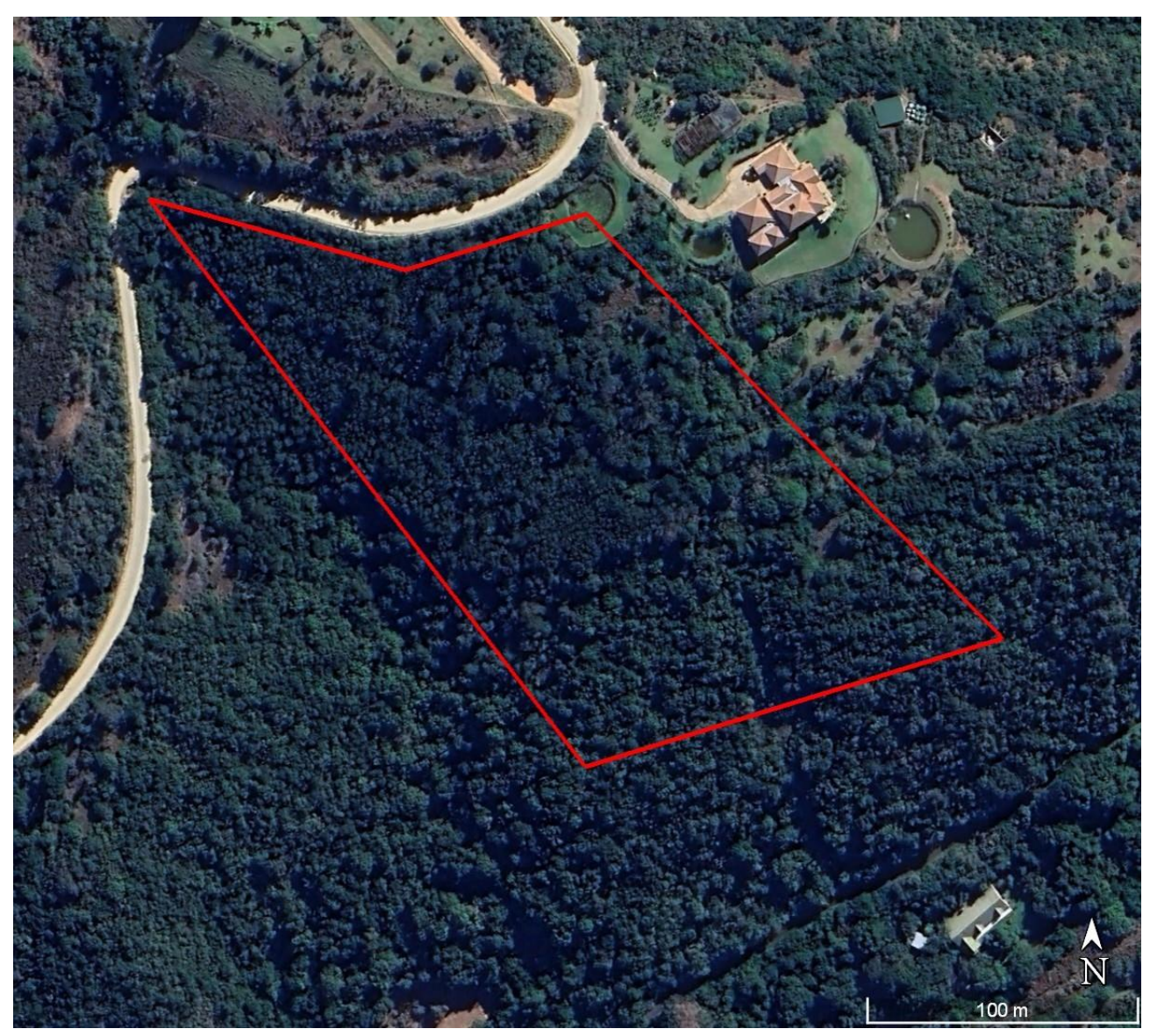
Figure 3. Satellite image map of the property.

production potential. These factors include its location surrounded largely by non-agricultural land uses, the lack of any existing cropping infrastructure or inputs, which would therefore necessitate agricultural investment for crop production, and the small size of the property, which prevents economies of scale. As a result of all the constraints, the site is unsuitable for any agricultural production.