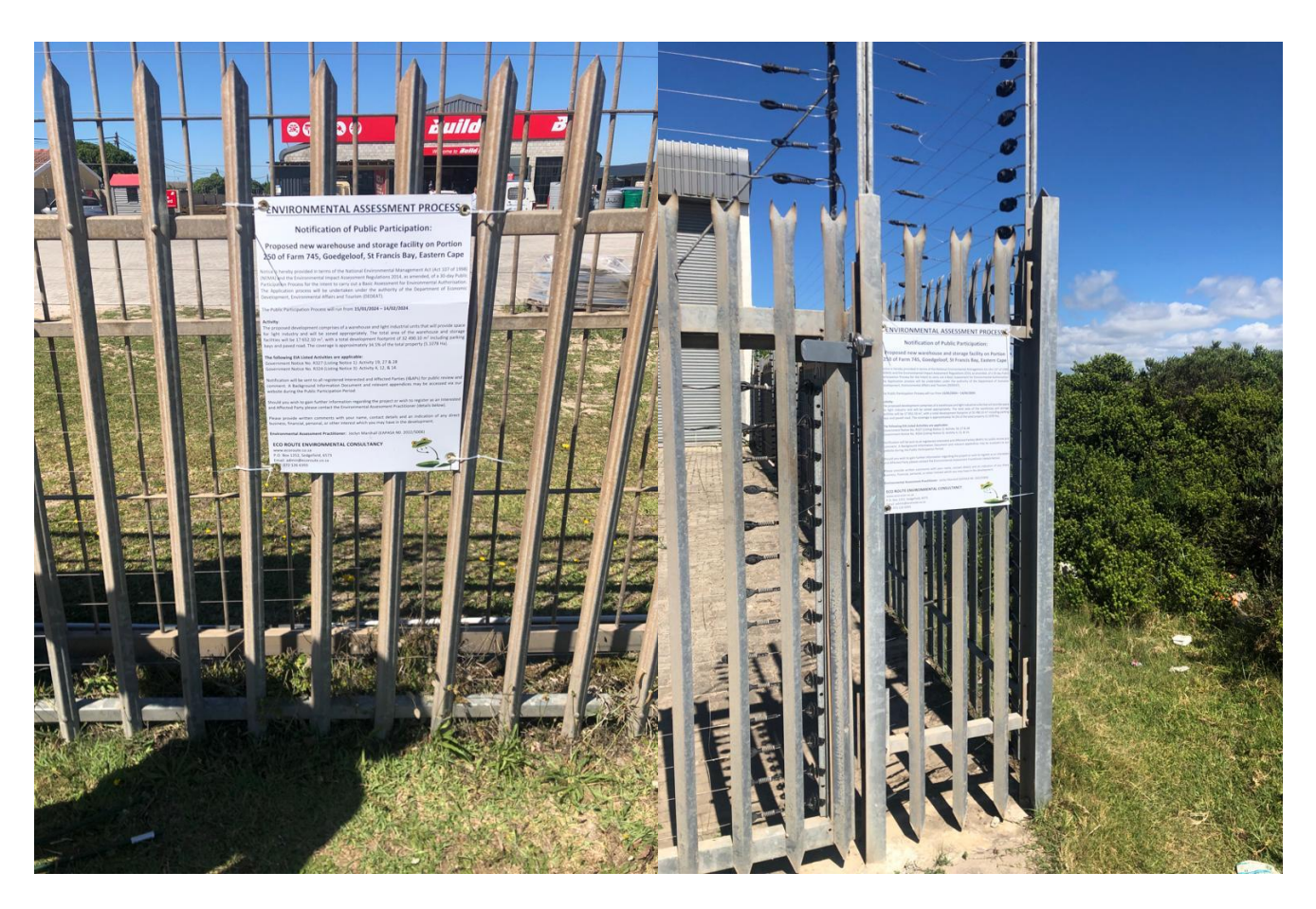
Figure 2: Two site signs were erected near the entrance of Portion 250 of 745, coordinates 34°10'21.79"S, 24°49'4.65"E (left) and 34°10'20.87"S, 24°49'19.22"E (right)