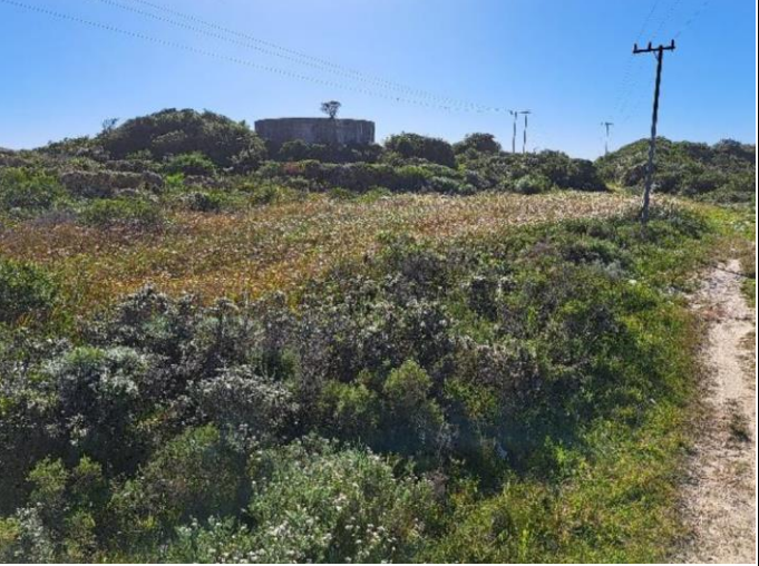
14. Artificial Wetland A (Confluent Environmental).