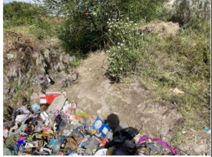
13. Illegal sand mining and waste dumping on site (DSA).