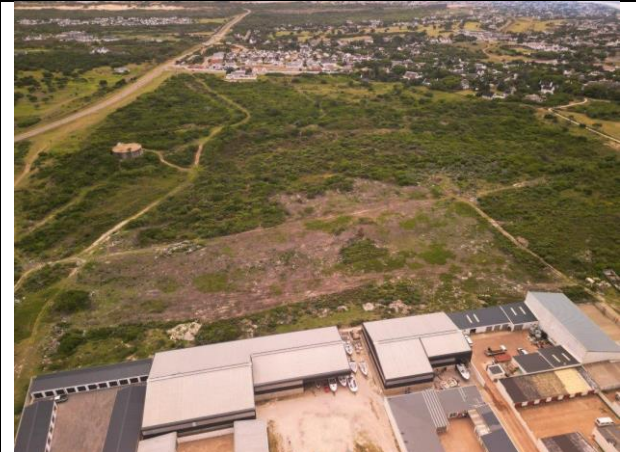
9. Aerial view looking north over the property.