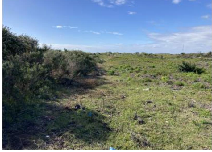
11. Dense scrub and cleared areas (DSA).