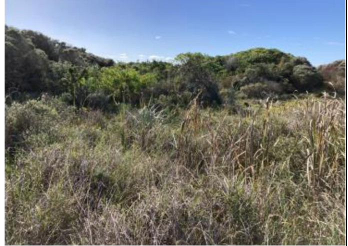
12. Wetland vegetation observed between the shrubs (DSA).