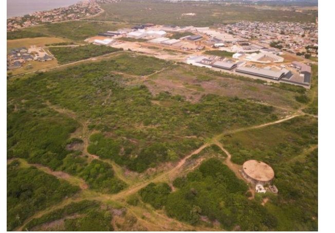
7. Aerial view looking southeast over the property.