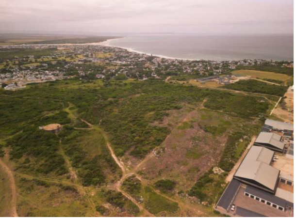
8. Aerial view looking northeast over the property.