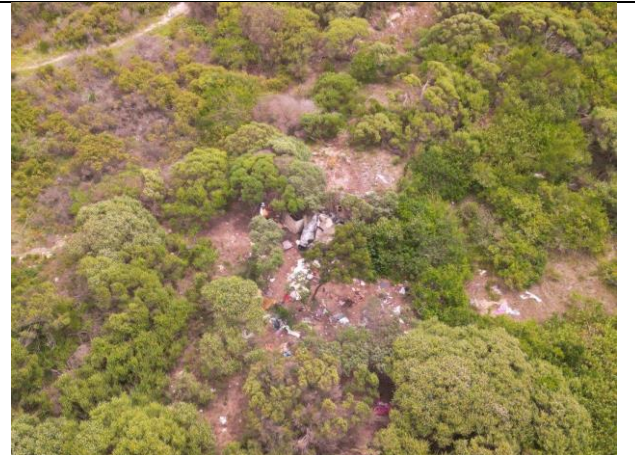
10. Aerial view of illegal dumping on site.