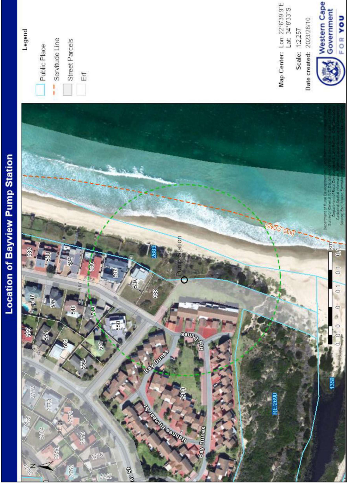
Figure 1: Location of pumpstation within 100 meters of highwater mark of the sea