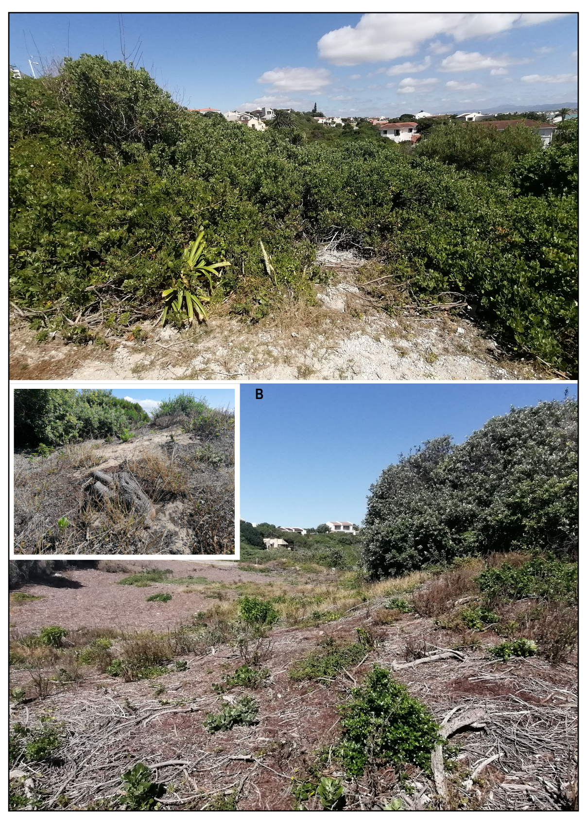
Plate 1: Examples of the vegetation features used to assess animal habitats in the project area before vegetation clearing occurred. A, Dune Thicket habitats adjacent to the project area where alien invasive Rooikrans Acacia cyclops and Port Jackson willow Acacia saligna have established. B, Several Thicket shrubs and trees have resprouted at the site after vegetation clearing occurred, while alien invasive plants will likely resprout from rootstocks that were left intact (inset) and recruiting seedlings.