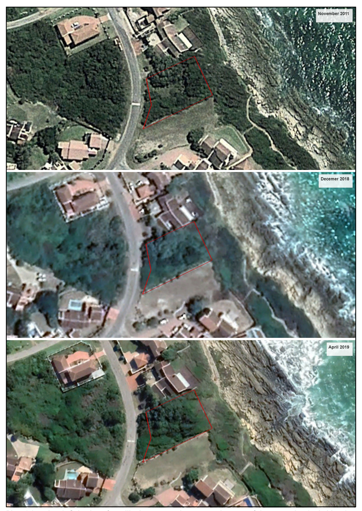
Plate 2 (continue): Selection of satellite images used to assess the state of the vegetation (or habitats) at the site before vegetation clearing occurred.