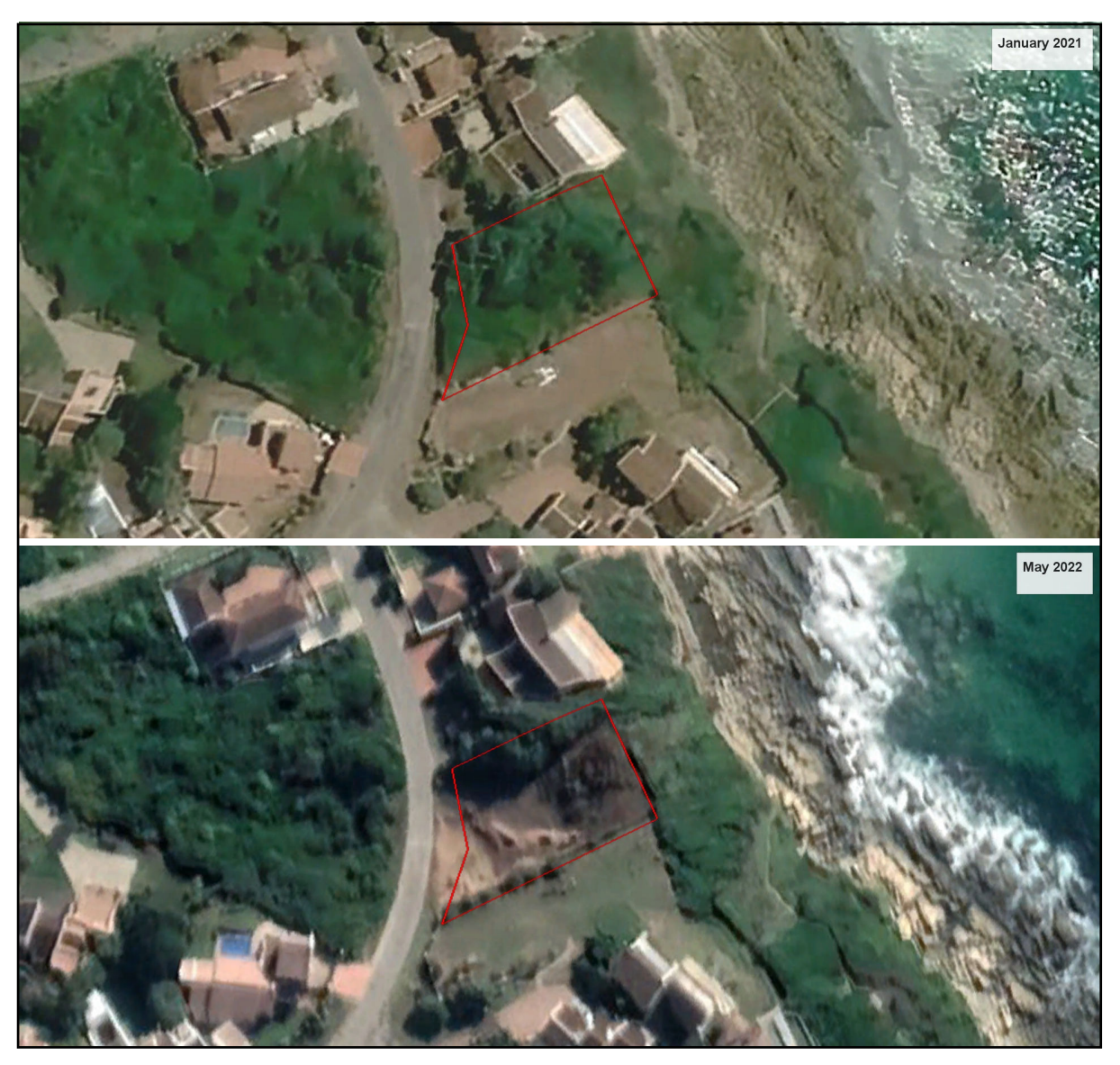
Plate 2 (continue): Selection of satellite images used to assess the state of the vegetation (or habitats) at the site before vegetation clearing occurred. May 2022 shows the unauthorised clearing.

The project area is not located in any of South Africa's Important Bird and Biodiversity Areas (Marnewick et al. 2015).