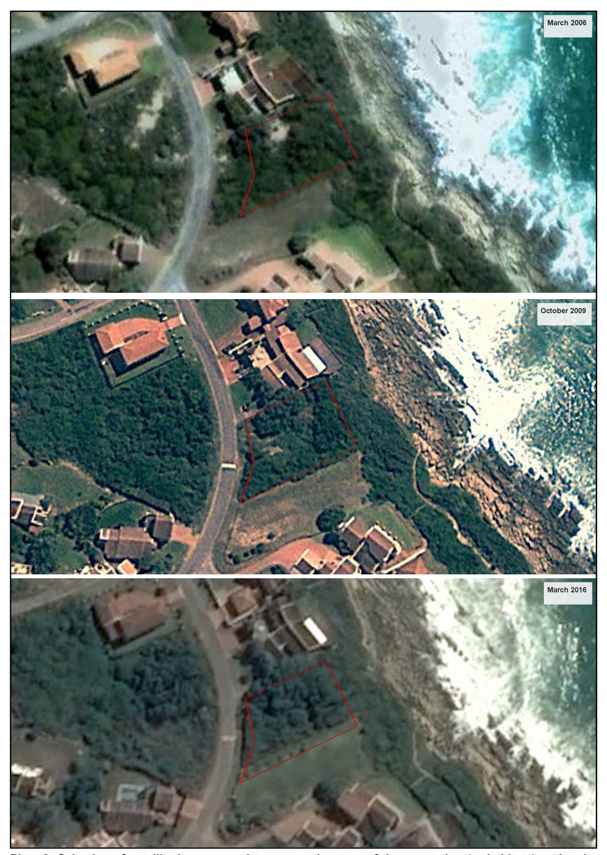
Plate 2: Selection of satellite images used to assess the state of the vegetation (or habitats) at the site before vegetation clearing occurred. May 2022 shows the unauthorised clearing.