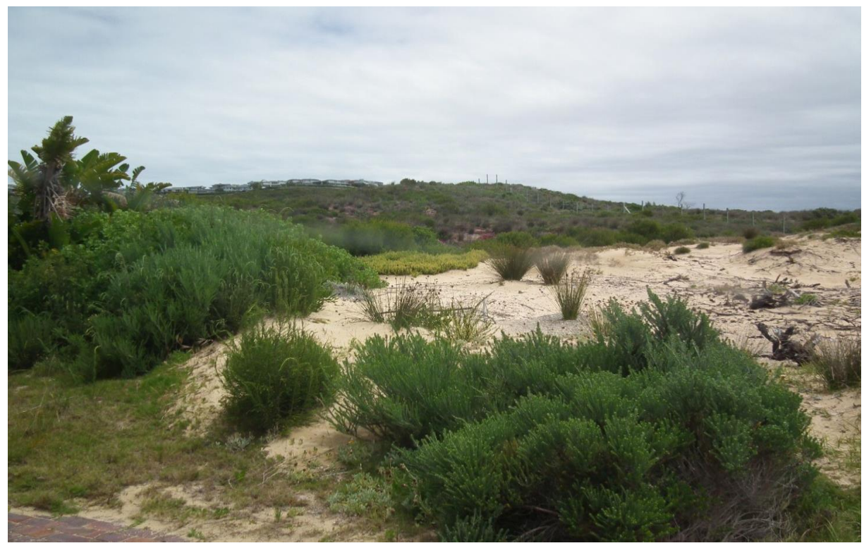
PLATE 4: GENERAL VIEW OF THE PROPERTY FROM EXISTING ACCESS.