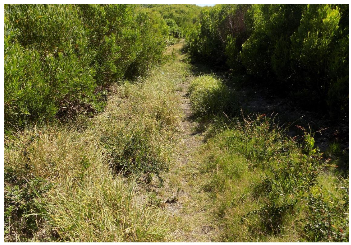
PLATE 7: ACCESS ROADWAY TO THE ORIGIONAL HOUSE.