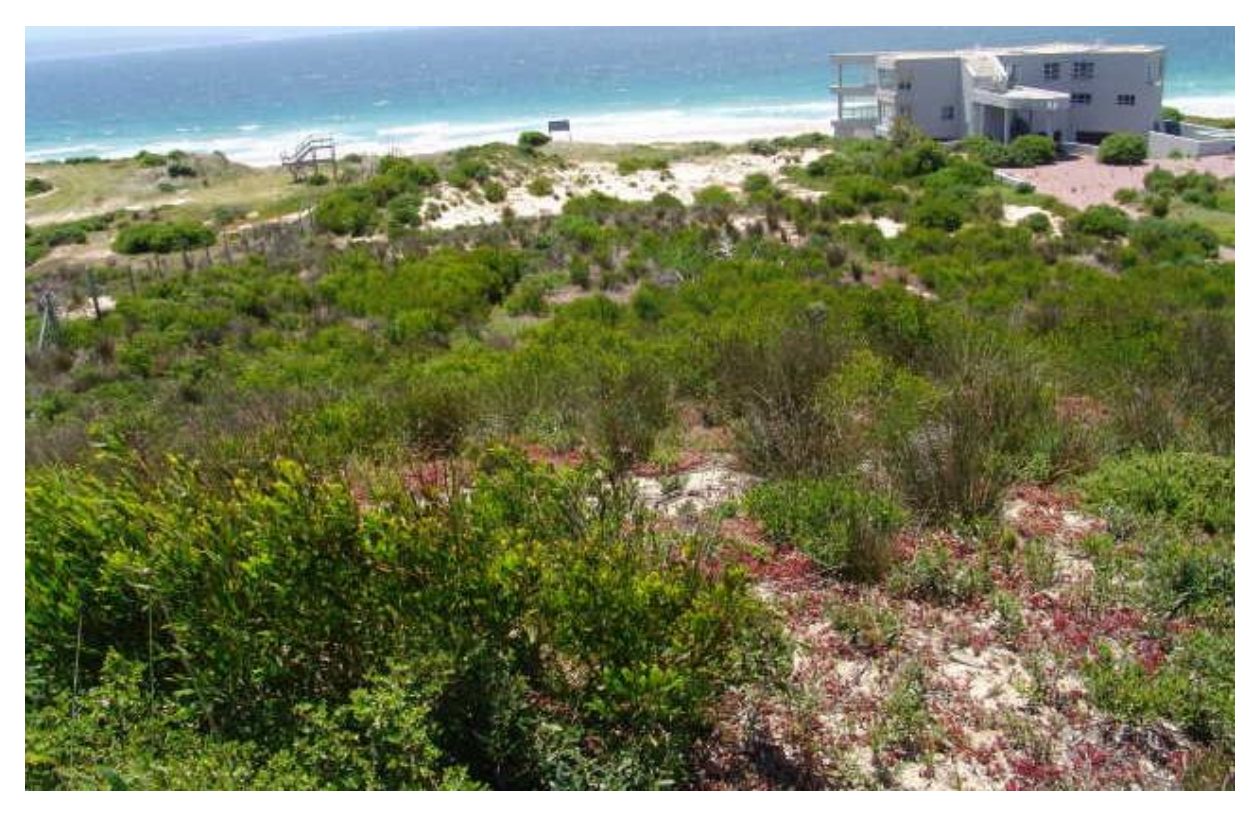
PLATE 5: EXISTING INFRUSTRUCTURE ON THE EASTERN SIDE OF THE PROPOERTY.