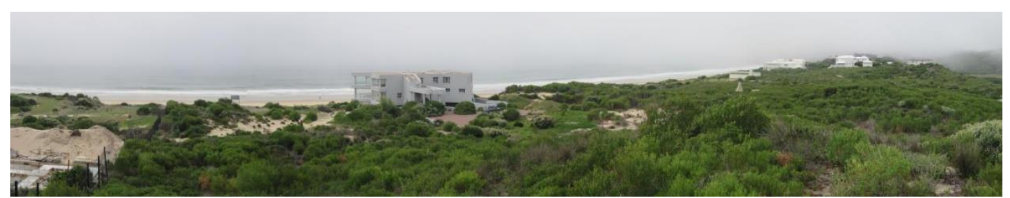
PLATE 10: SOUTHWEST AND EAST VIEWS FROM THE HIGH DUNE ON THE NORTHWESTERN PART OF THE SITE.