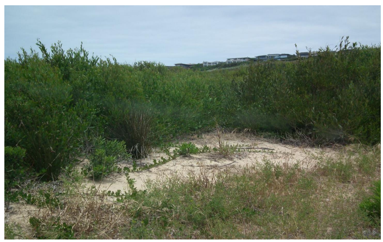
<u>PLATE 3</u>: PROPERTY VIEWED TO THE NORTHWEST WITH DISTURBED VEGETATION ON SITE.