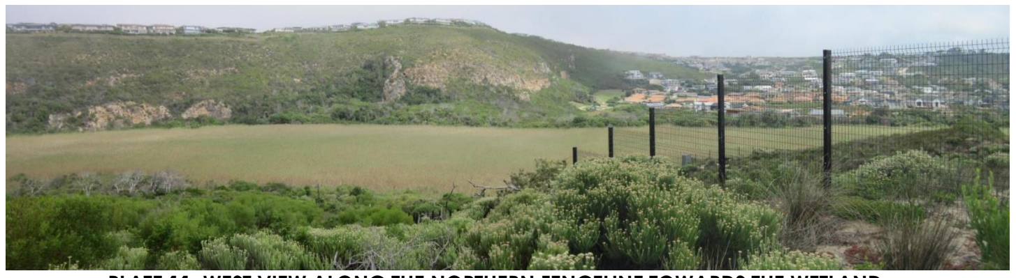
PLATE 11: WEST VIEW ALONG THE NORTHERN FENCELINE TOWARDS THE WETLAND.