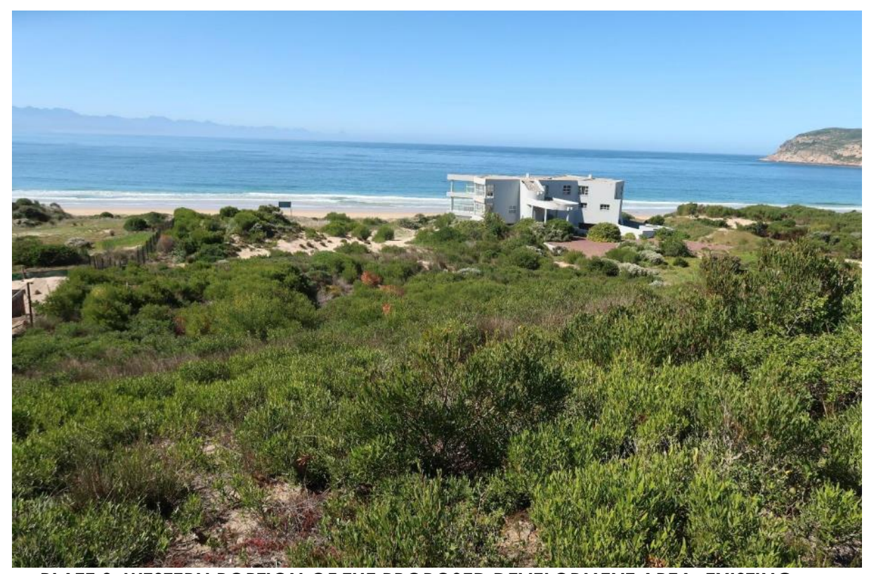
<u>PLATE 9:</u> WESTERN PORTION OF THE PROPOSED DEVELOPMENT AREA, EXISTING STRUCTURE IN THE CENTRE AND NORTHERN BOUNDARY FENCE TO THE LEFT.