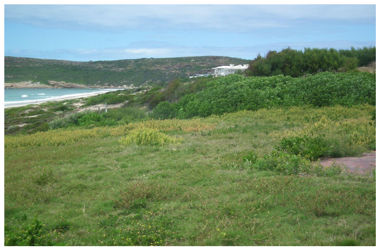
PLATE 1: THE SITE VIEWED LOOKING SOUTHEAST TO ROBBERG.