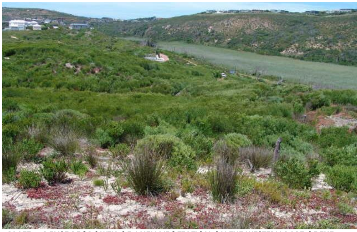
PLATE 6: DENSE REGROWTH OF ALIEN VEGETATION ON THE WESTERN PART OF THE PROPERTY.