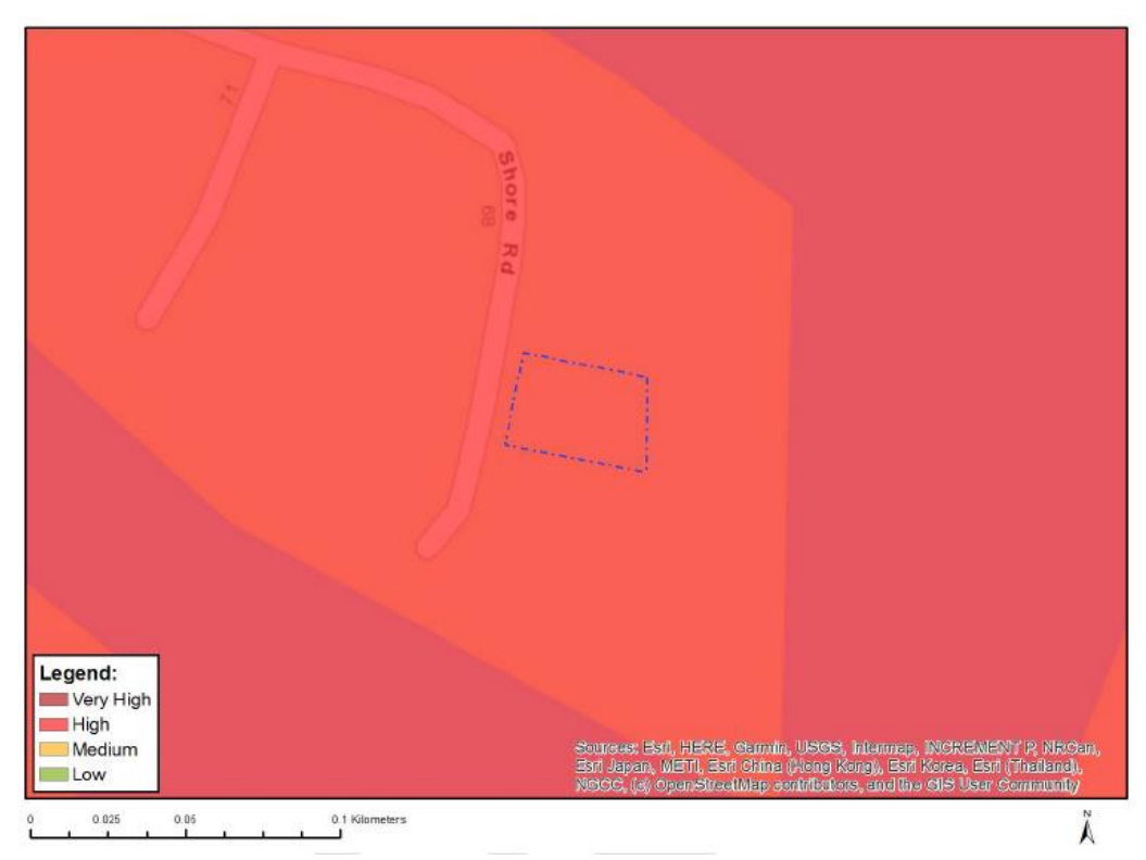
Figure 6: Map of Relative Civil Aviation Theme as per the Screening Tool Reports

As the development is of a residential nature and occurs within an urban area, all municipal bylaws will be implemented to restrict building heights. Therefore, it is motivated that a specialist assessment will not be necessary to conduct for the Basic Assessment Report.