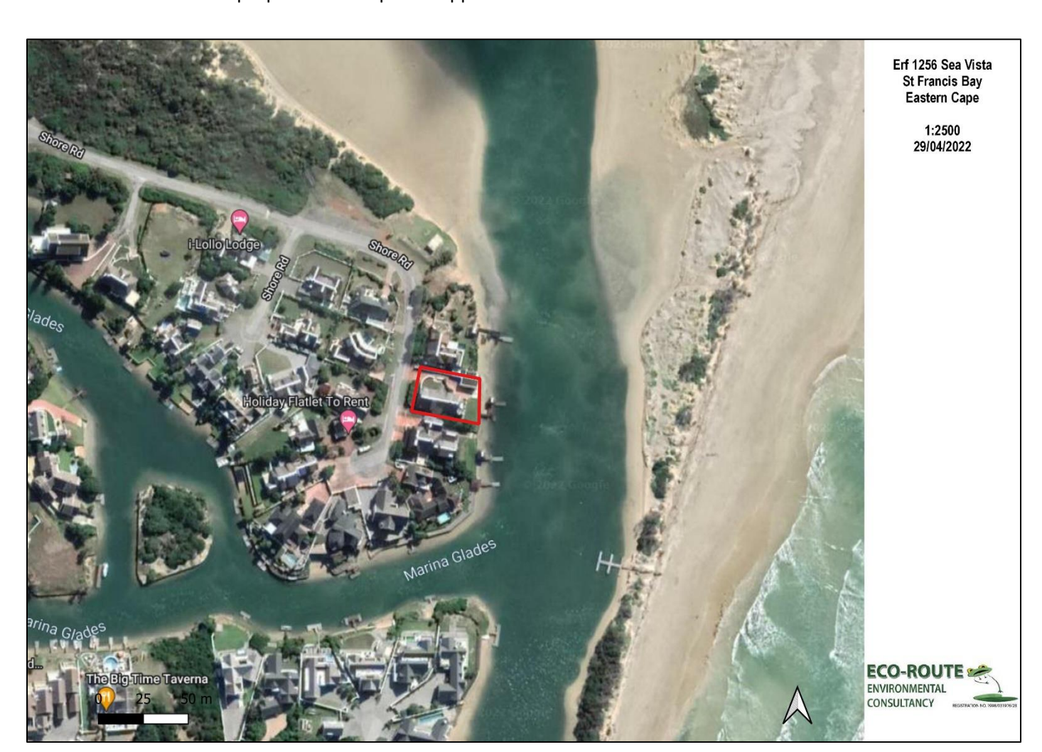
Figure 1: Locality of Erf 1256, Sea Vista (red polygon)

As required to compliment a Basic Assessment application the national web-based screening tool was used to generate a screening report. The screening report lists a variety of specialist studies to be undertaken based on the data informants of the tool at the study area. This site sensitivity verification report, following ground-truthing of the site, motivates the reason why certain specialist studies will not be required or conducted for the proposed development application.