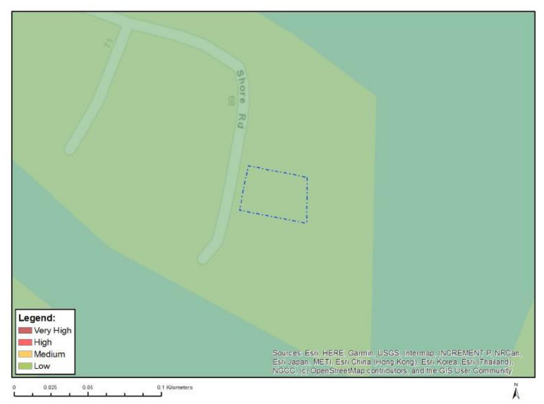
Figure 5: Archaeological and Cultural Sensitivity Theme: Low, as per the Screening Tool Reports

The development will not trigger Section 38 of the National Heritage Resources Act (no.25 of 1999). In addition, no heritage artefacts or remains were noted on the site. It is also possible that previous site clearance could have disturbed or destroyed any artefacts of historical significance. It is motivated that an Archaeological specialist will not be required for the Basic Assessment Report; however, the applicant will be advised that should artefacts or remains be noted during site clearance, the Eastern Cape Provincial Heritage Resources Authority/ ECPHRA must be alerted. ECPHRA will be included as an I&AP during the EIA process and any comments received will be included in the Basic Assessment Report.