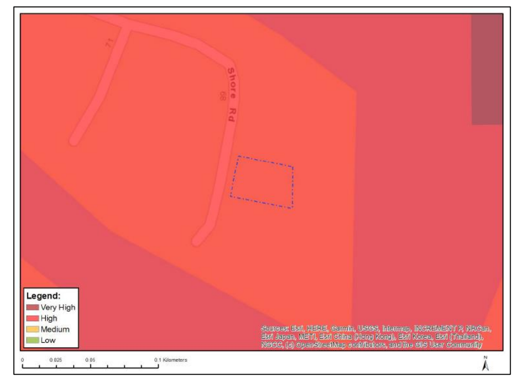
Figure 2: Map of relative agriculture theme sensitivity