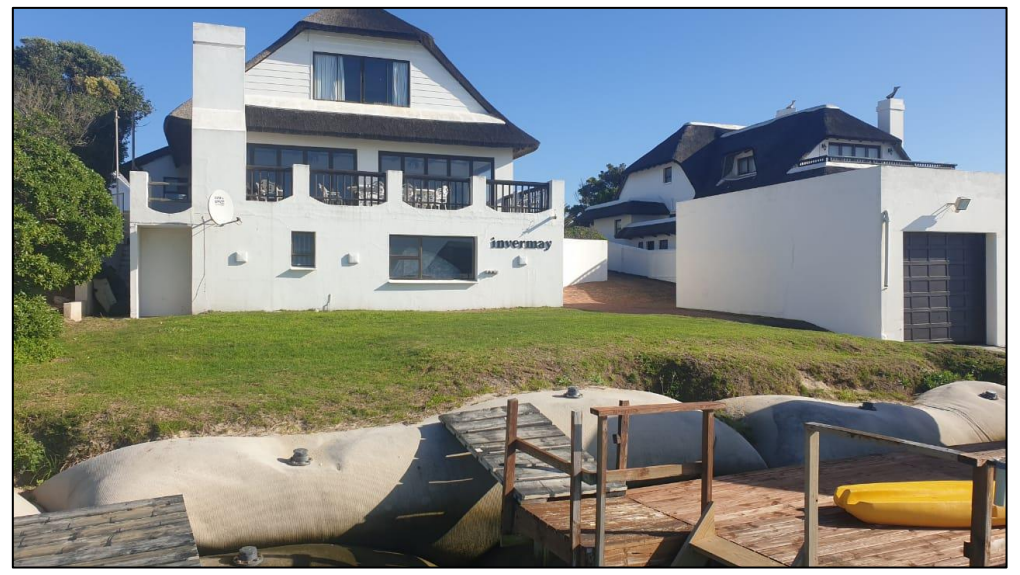
Figure 3: image showing Erf 1256 has mowed lawns