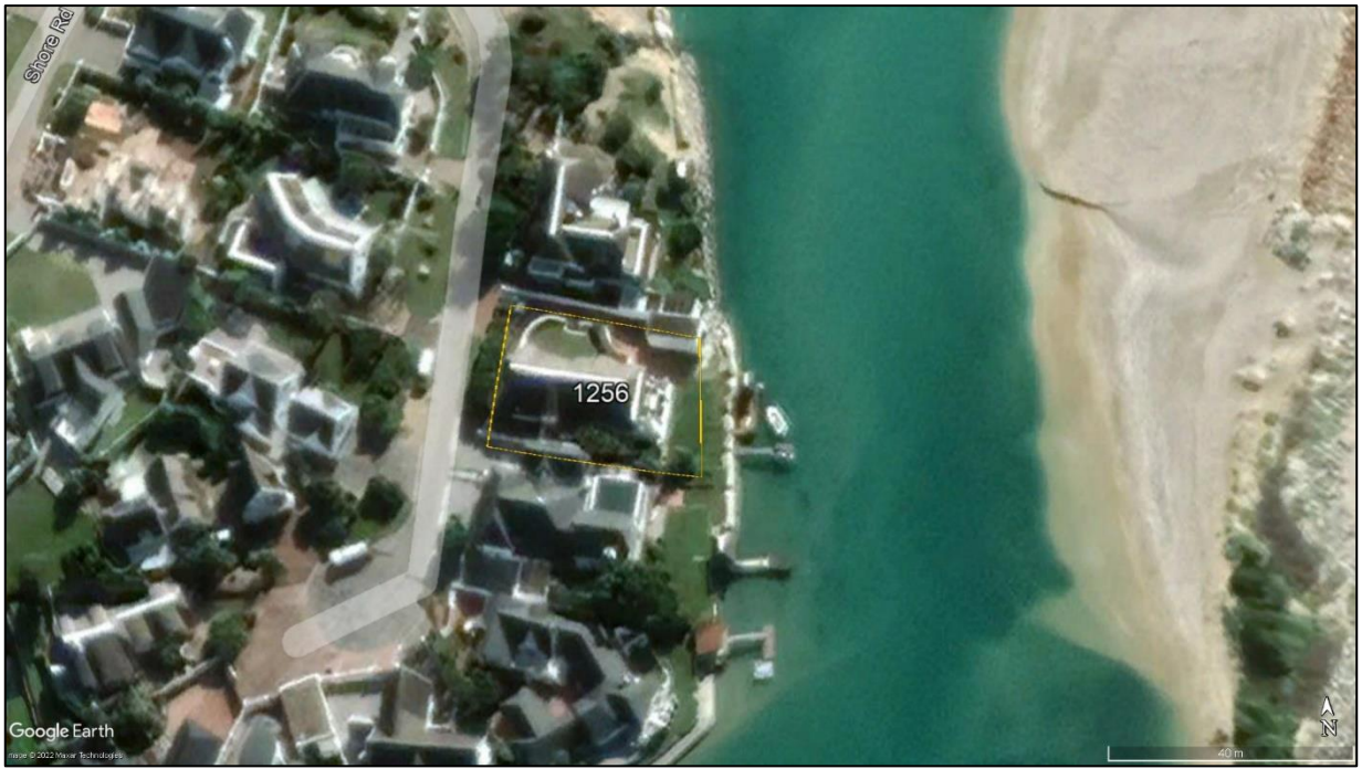
Figure 4: Google Earth image showing that the property has been developed.

GIS mapping reveals the development site as having a NFEPA wetland present on approximately 50% of the property. This is most probably because the property occurs within an estuarine functional zone as it is located adjacent to the Marina Glades canal, of the Kouga River. However, this property has been developed for many years and the vegetation present on the site is not suitable to host thriving biodiversity; therefore, it is motivated that an Aquatic Biodiversity Sensitivity Assessment will not be necessary to conduct for the Basic Assessment process.