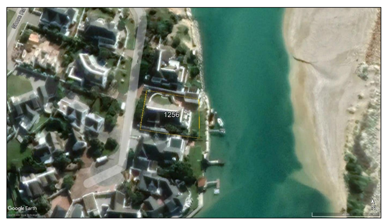
Figure 9: Google Earth image showing very little vegetation on the property which is dominated by mowed lawn.

A Terrestrial Plant Species Specialist has been identified as one of the specialist inputs to be included in the EIA process. However, as there is an existing dwelling on the property which occupies majority of the property, and the property contains only two small patches of mowed lawn; it is motivated that the plant species theme sensitivity identified by the Screening Tool Report is incorrect and a Terrestrial Plant Species Specialist is not necessary for the EIA.