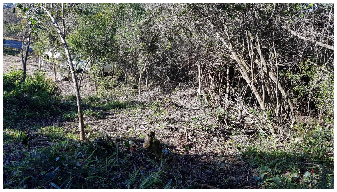
Figure 4: New position of the house showing some clearing for the accommodation unit.