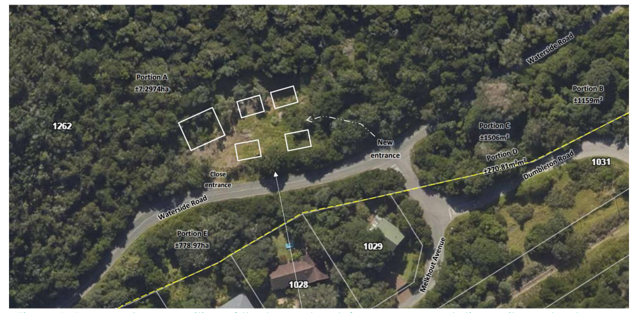
Figure 1: Proposed new position of the homestead, four accommodation units, and entrance.

The other two accommodation units will be on the level above, which is mostly already disturbed due to an existing old track (figure 3). The position of the homestead has been moved out of the dense forested area to a more open area to the west (figure 4).