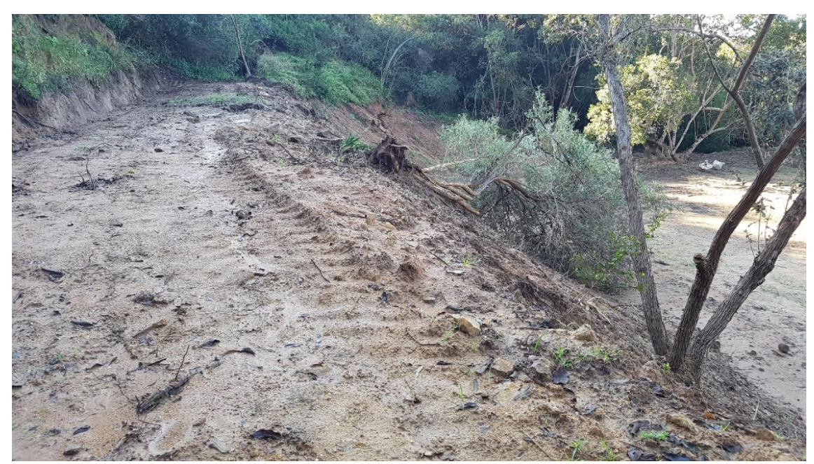
Figure 3: Existing old track and position of two of the accommodation units.