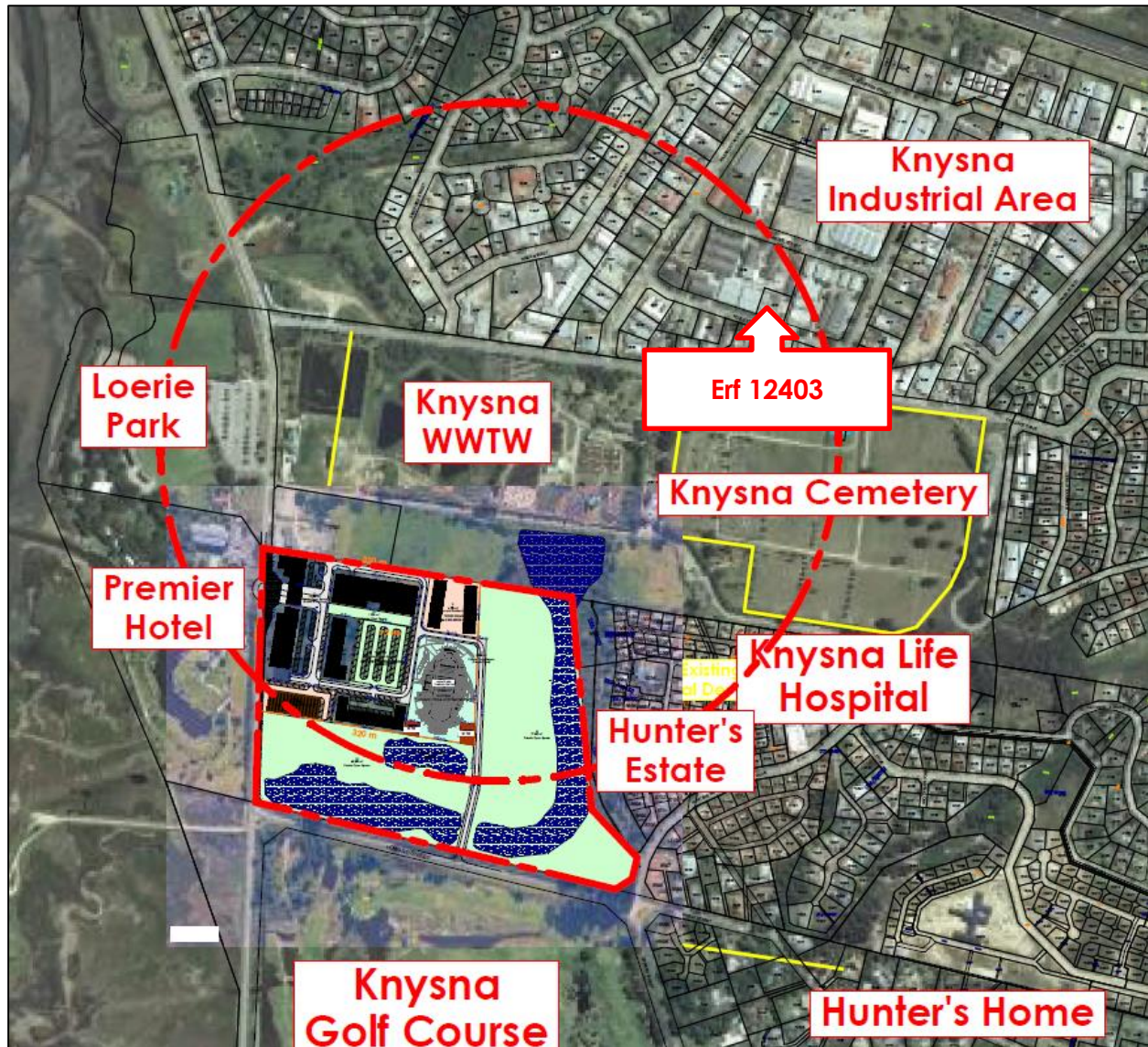
FIGURE 2: APPLICATION AREA IN RELATION TO KNYSNA WWTW

Permission is therefore requested to allow the proposed development within 500m of the Knysna Municipality's WWTW and the Knysna Cemetery.